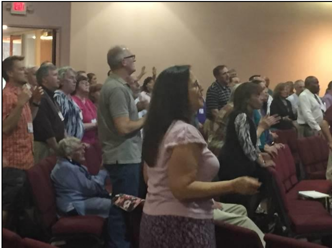
Worship was an important part of our time together.