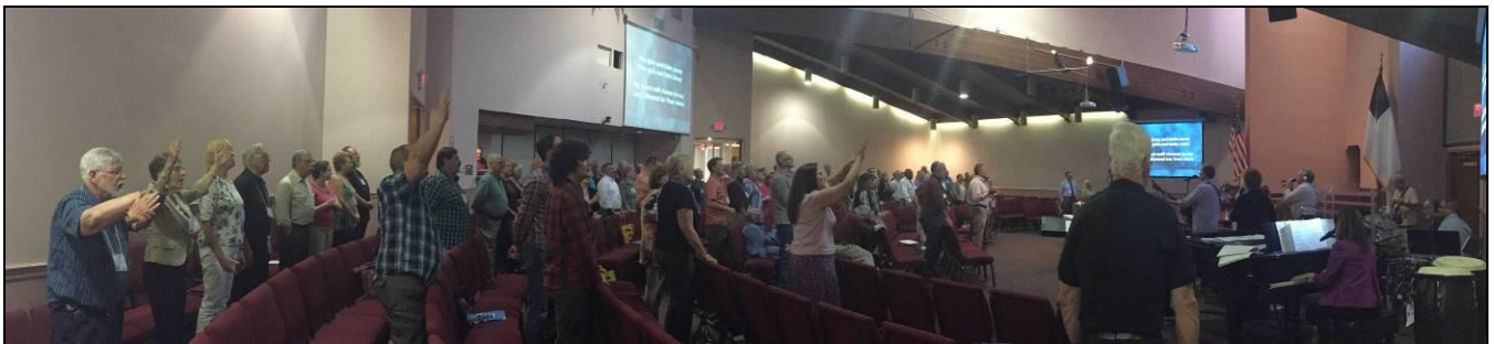
The worship team from Centerpoint Community Church led us in worship on Friday evening.